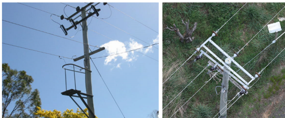
Figure 2: The same pole seen from the ground and from the air

In 2014/2015 for the first time TasNetworks started inspecting its assets from the air. This provided a previously hidden view of the network that showed many assets were in worse condition than previously thought. In particular there was a spike in decayed timber crossarms reported, as these tend to rot on top while remaining intact on the underside, making it difficult to detect from ground patrols. Aerial inspections are done on a five year cycle. There is expected to be an increase in overhead maintenance over the next five years (2015/2016 – 2020/2021), following the first round of aerial inspections as these will pick up defects that have gone undetected for many years. The second round of aerial inspections is expected to yield a much lower volume of maintenance work.