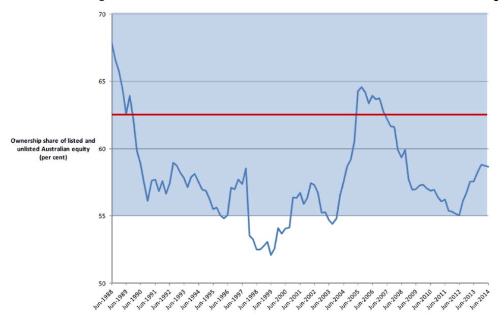
The shaded area is the AER's proposed range. The red line represents the mid-point of the AER's proposed range.