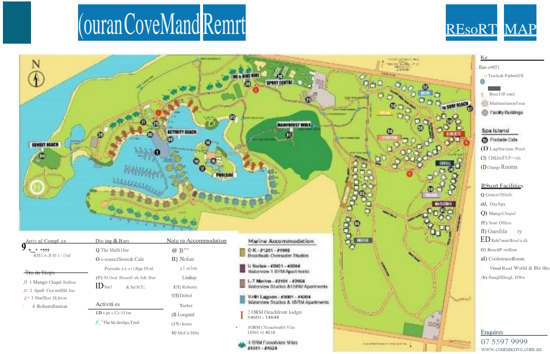
Figure 1. Resort Map