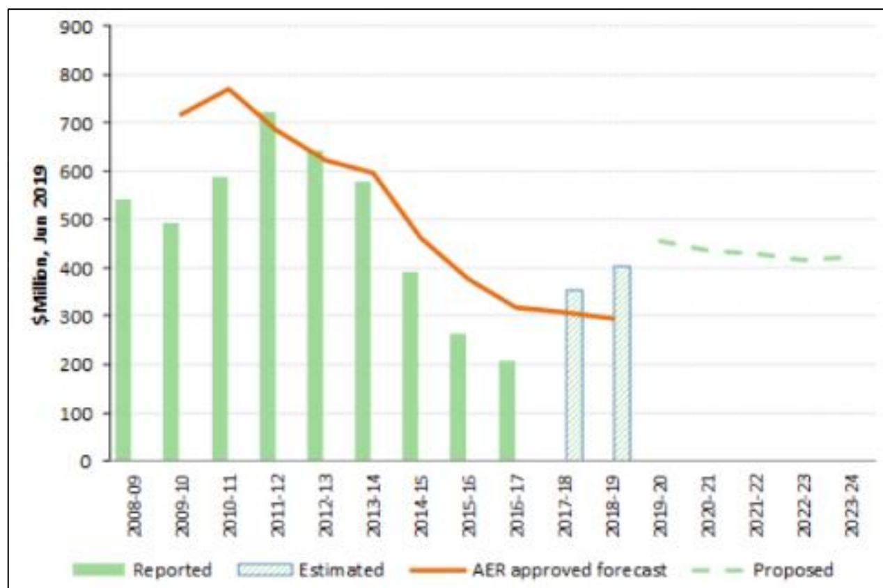
Figure 1 – Comparison of Endeavour's past and forecast capex