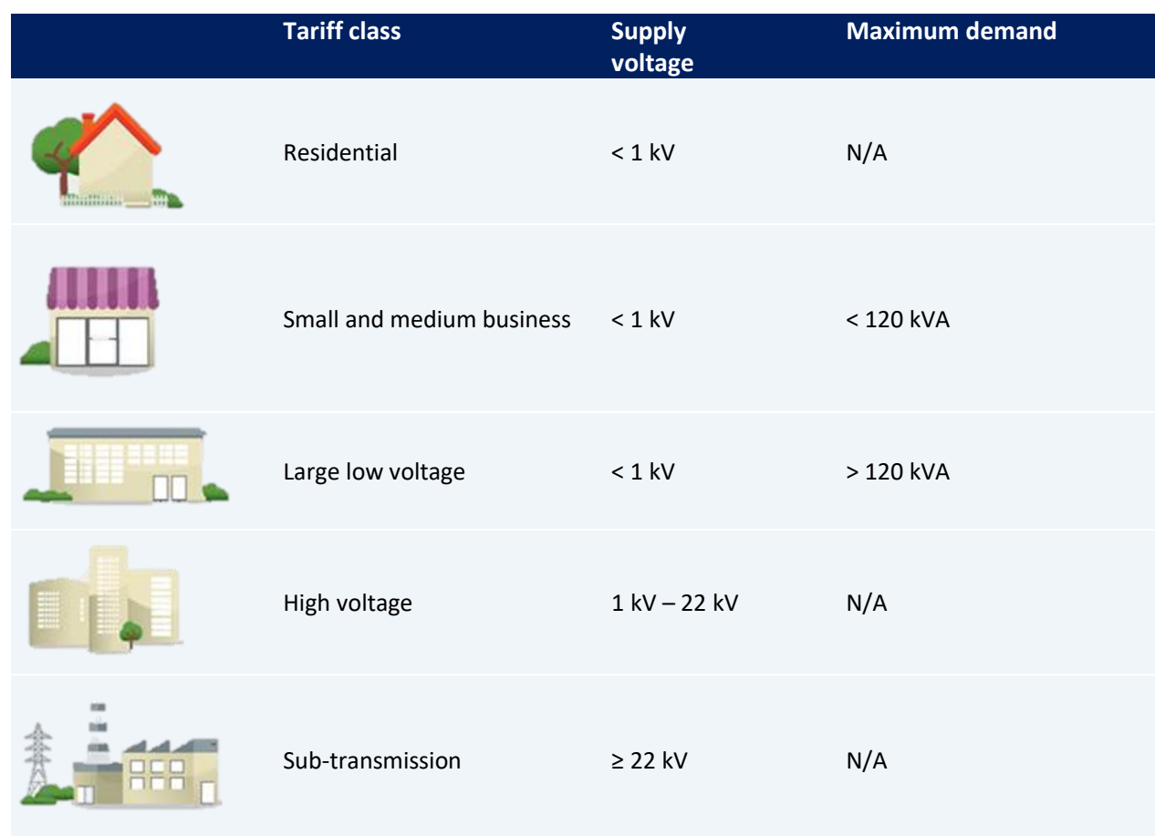
Figure 1 Tariff classes

All alternative control services are a separate asset class.