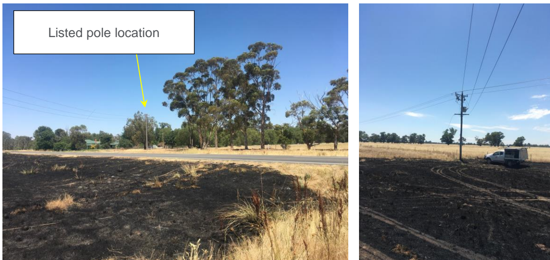
Figure 2: Photos showing the location of the fire relative to the location of the impacted pole