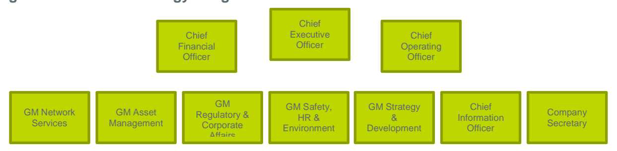
Figure 1: Endeavour Energy's organisational structure

Endeavour Energy are a 'poles and wires' business, responsible for the safe and reliable supply of electricity to 2.4 million people in households and businesses across Sydney's Greater West, the Blue Mountains, Southern Highlands, the Illawarra and the South Coast.