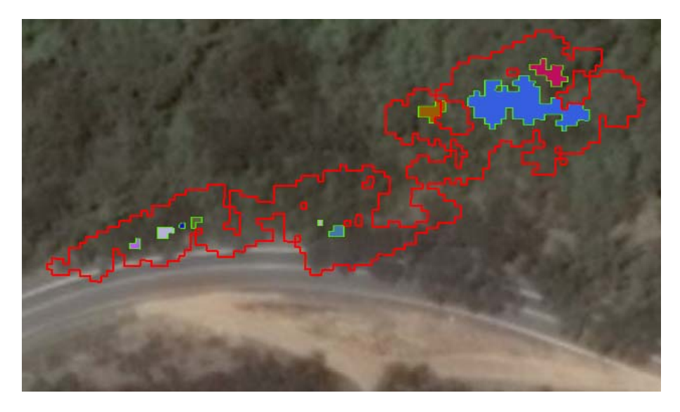
Table 3.7.2.5 – Representation of defect vegetation areas. Red outline shows a single contiguous in 2014 (n = 1), but subsequently in 2015 the defects have reduced in size but are separate areas (n = 9).