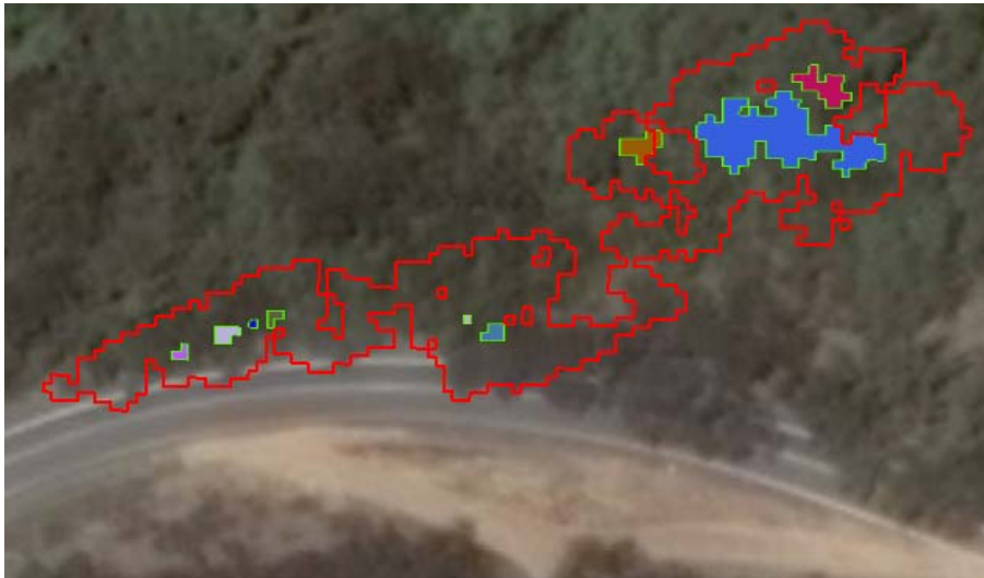
Table 3.7.2.5 – Representation of defect vegetation areas. Red outline shows a single contiguous in 2014 (n = 1), but subsequently in 2015 the defects have reduced in size but are separate areas (n = 9).

The increase in number of defects per span in 2015 is due to the manner in which vegetation encroachments are collected and classified. The defect classification for 2015 factors in the span length and voltage to determine clearance requirements and therefore defect. Technology, LiDAR sensor and processing improvements have enabled more detailed data acquisition. This detail means a single defect in 2014 may have been represented by a larger contiguous area, whereas with the improvements individual canopies and encroachment defects are identified. Additionally, following vegetation trimming and clearance, regrowth will result in a greater number of smaller individual canopies which are detected as individual defects. In total, due to the above improvements the number of defects has increased but the area of vegetation causing the defect has decreased. In 2014, the total area for vegetation defects was 17,469,898.20 m 2 whereas in 2015 the total area was 8,133,267.48 m 2 (a reduction of approximately 53%). Figure 3.7.2.5 (below) shows an example where a large contiguous area of defect vegetation (n = 1) has been cleared but regrowth has been detected as a number of smaller defect areas (n = 9).