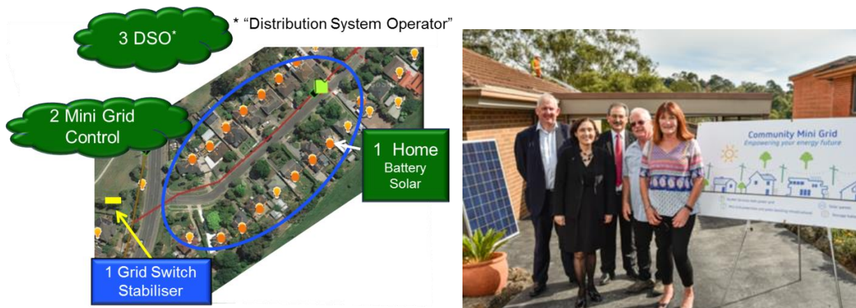
Figure 1 a) Site layout and key components of the Mini Grid, b) Official opening of the Mini Grid

The project will also test the performance of DER systems in providing backup supply to individual customers in case of network outage, and also the ability for the mini grid as a whole to operate as an island (grid-separated mode) for short periods of time, with sharing of power between customers in order to maintain system stability and longevity. Both cases have undergone considerable investigation from the perspective of safety and protection system performance. In particular the intent to operate the whole mini grid as a 3-phase island with 100% inverter based supplies is a ground-breaking technical initiative.