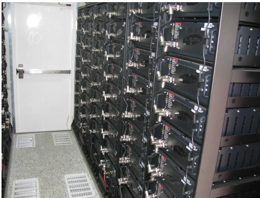
Figure 4 Battery container view from inside.

A two year trial plan was developed for the summer peak periods of 2014/15 and 2015/16. The trial plan comprised a comprehensive range of tests including peak demand lopping, power factor correction, voltage support, voltage waveform harmonics, current waveform harmonics, negative sequence voltages, phase load balance, flicker and islanded operation including transitions to and from islanded supply.