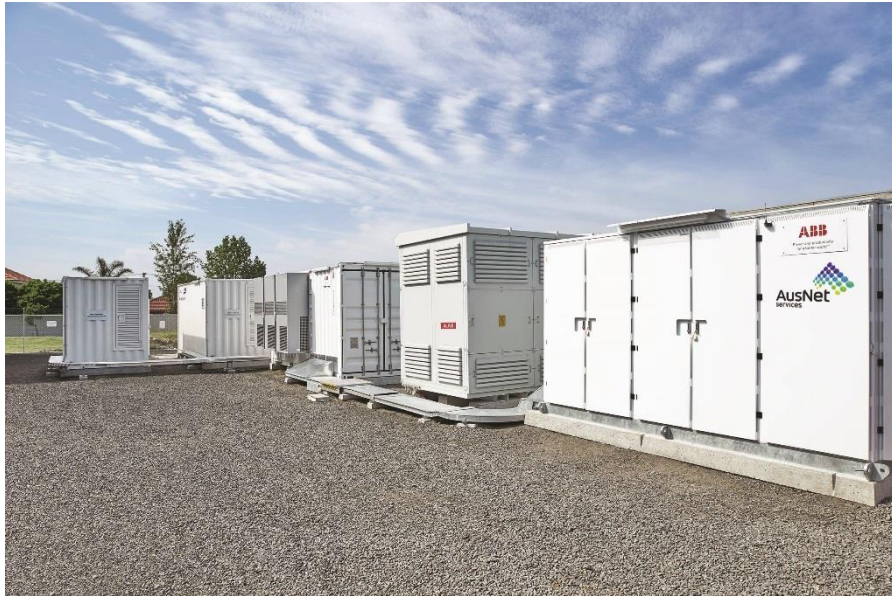
Figure 3 The GESS, installed and operational. Battery containers are in the background, with the inverter, transformer and switchgear containers in the foreground.