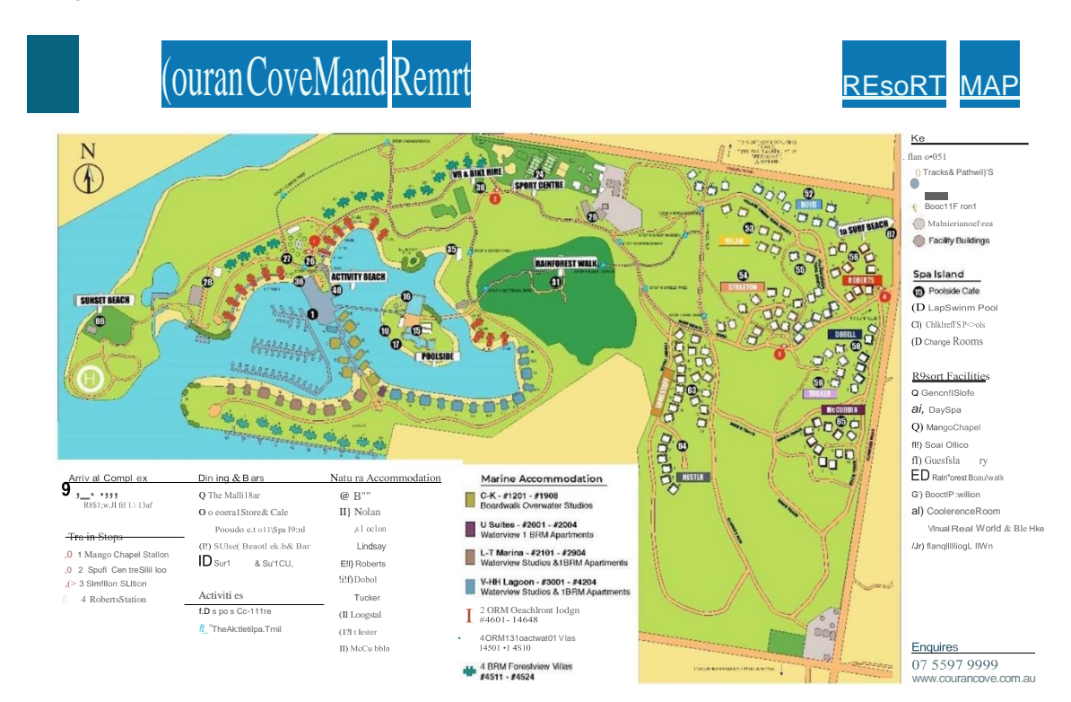
Figure 1. Resort Map