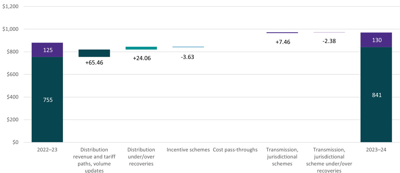
Figure 1 Residential: Average annual network charge