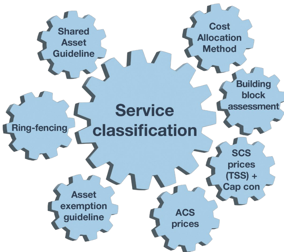
Figure 1.1 Interaction between service classification and other elements of the regulatory framework

As a result, our service classification decisions, and other issues that are decided through the F&A, form the regulatory foundation of the distribution determination we make for each distributor, for each five-year regulatory control period in determining the total amount of revenue recovered from consumers. 5