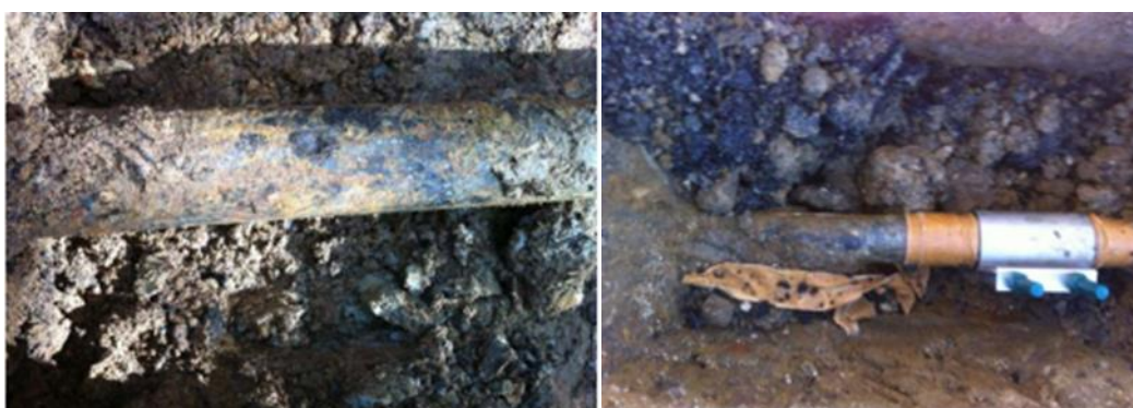
Figure 1-1&2: Examples of corroded cast iron mains and a repair clamp used throughout JGN

The cast iron mains were laid from the 1920s through to the 1970s, with the majority being laid during the 1950s and 1960s. Typical of the older ferrous gas mains in the industry, cast iron mains in the network do not have effective protection measures such as coatings or cathodic protection (CP). As a result, the unprotected ferrous mains have gradually corroded over the past 70+ years. The figures below indicate the inefficiency of repairing corroded cast iron mains, when compared to replacement of the main. The repair clamps currently used only address the localised leak, however adjacent areas of the main are likely to be equally corroded and are likely to fail in due course causing additional leaks.