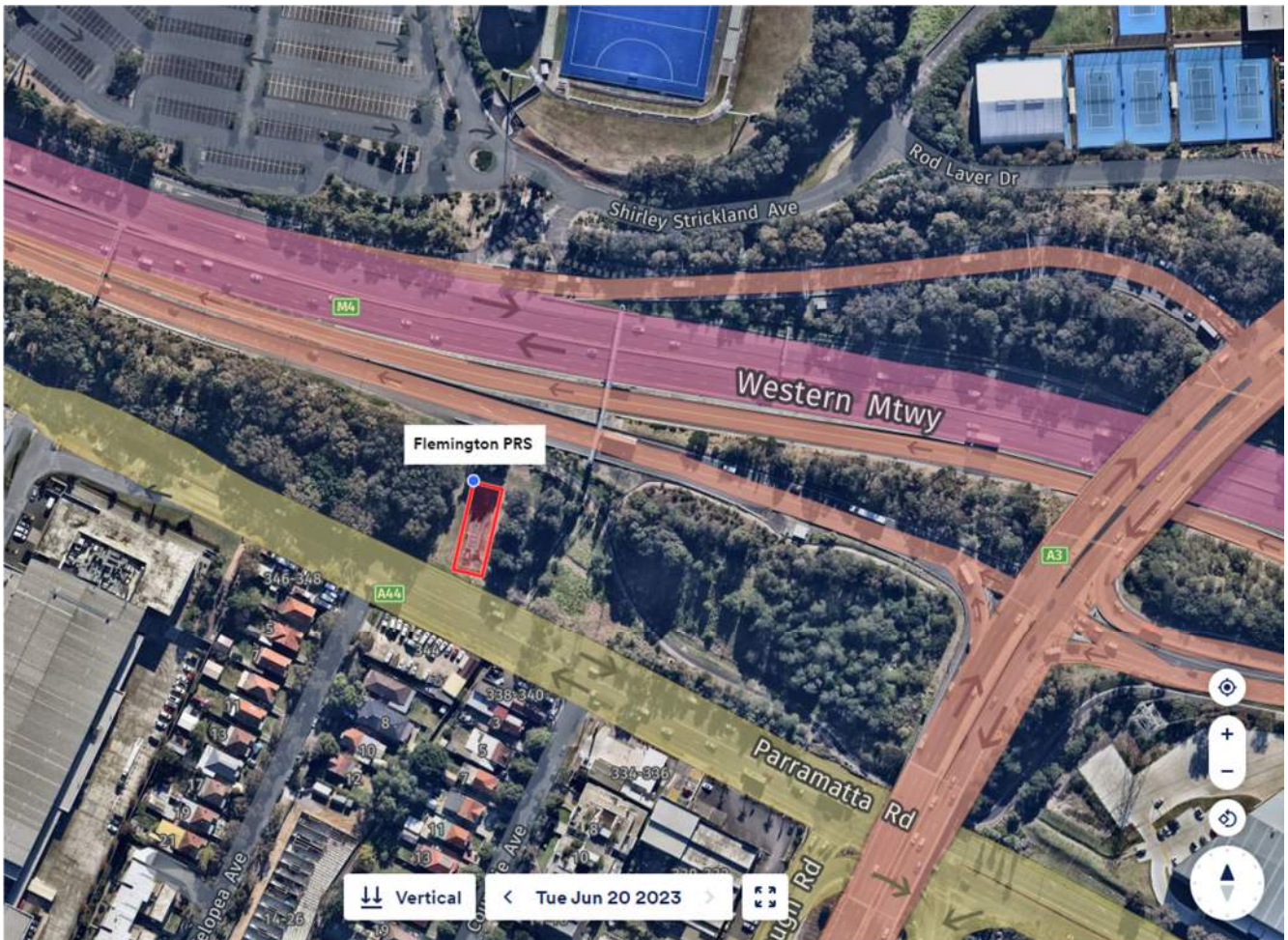
Figure 3-1: Flemington PRS Site Location

Flemington PRS, commissioned in 1976, is a high pressure gas facility owned and operated by JGN. It is located on Parramatta road, Flemington, NSW. The function of this facility is to reduce the pressure of natural gas received from the Sydney Primary Main (MAOP 3,500kPag) and distributing it to Flemington and the surrounding secondary networks (MAOP 1,050kPag). Flemington PRS supplies approximately 110,000 customers.