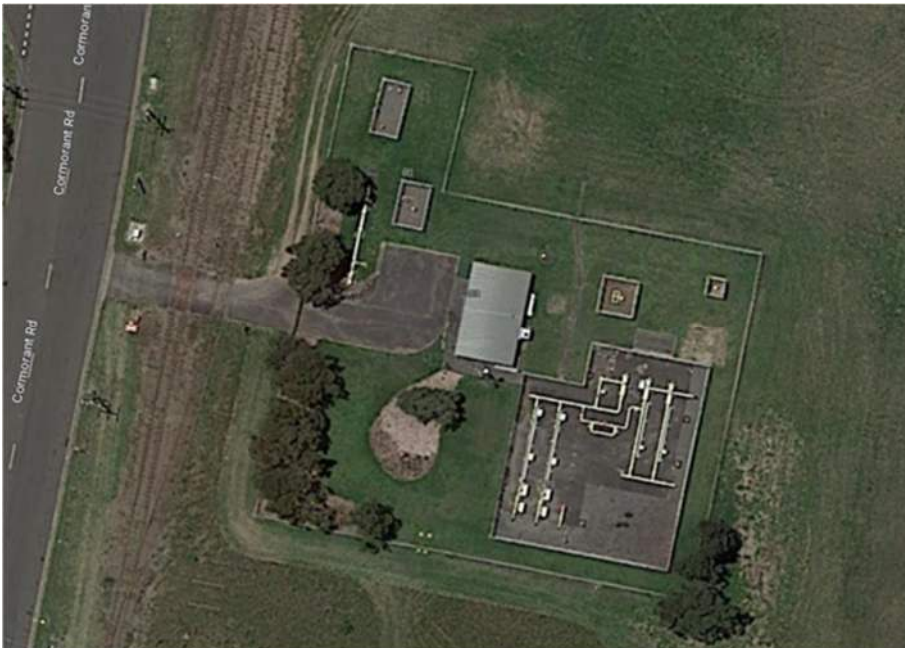
Figure 1: Kooragang Island TRS

Kooragang Island TRS is located on Cormorant Rd and is a natural gas pressure reduction facility (TRS), connected to Northern Trunk (Hexham to Kooragang Island) with MAOP 6,895kPag which is currently operating at MOP 6,200kPag. The station supplies the secondary distribution network (1050kPag) providing natural gas to approximately 1,500 domestic customers and the Orica Incitec Bulk Metering Station, one of Jemena's largest contract customers. The station is located in a security fenced compound and is provided with remote surveillance. The fenced compound is approximately 57m x 66m(46.5m on the Eastern fence).