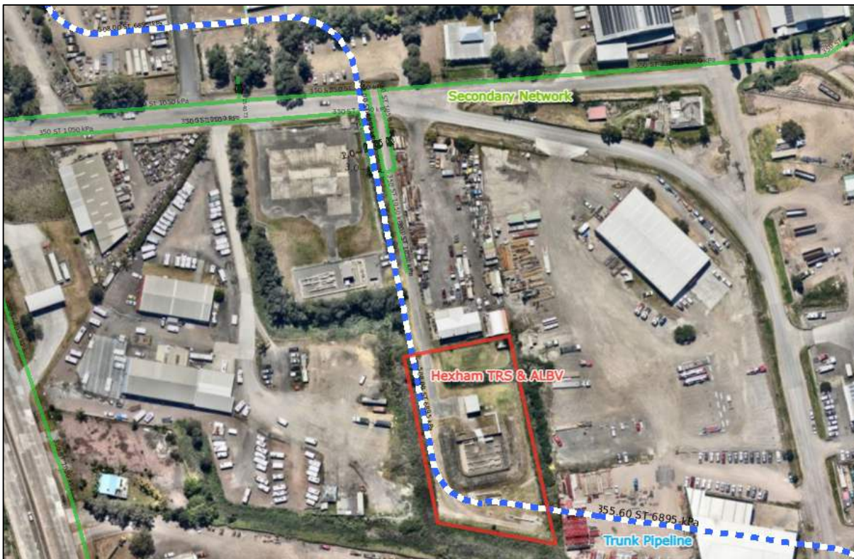
Figure 3-1: Hexham TRS Site Location

Hexham TRS, commissioned in 1984, is a high pressure gas facility owned and operated by JGN. It is located along Old Maitland Road, Hexham, NSW (see Figure 1). The function of this facility is to reduce the pressure of natural gas received from the Sydney Trunk Pipeline (MAOP 6,895kPag) and distribute to the Newcastle and surrounding secondary networks (MAOP 1,050kPag). Hexham TRS supplies approximately 110,000 customers.