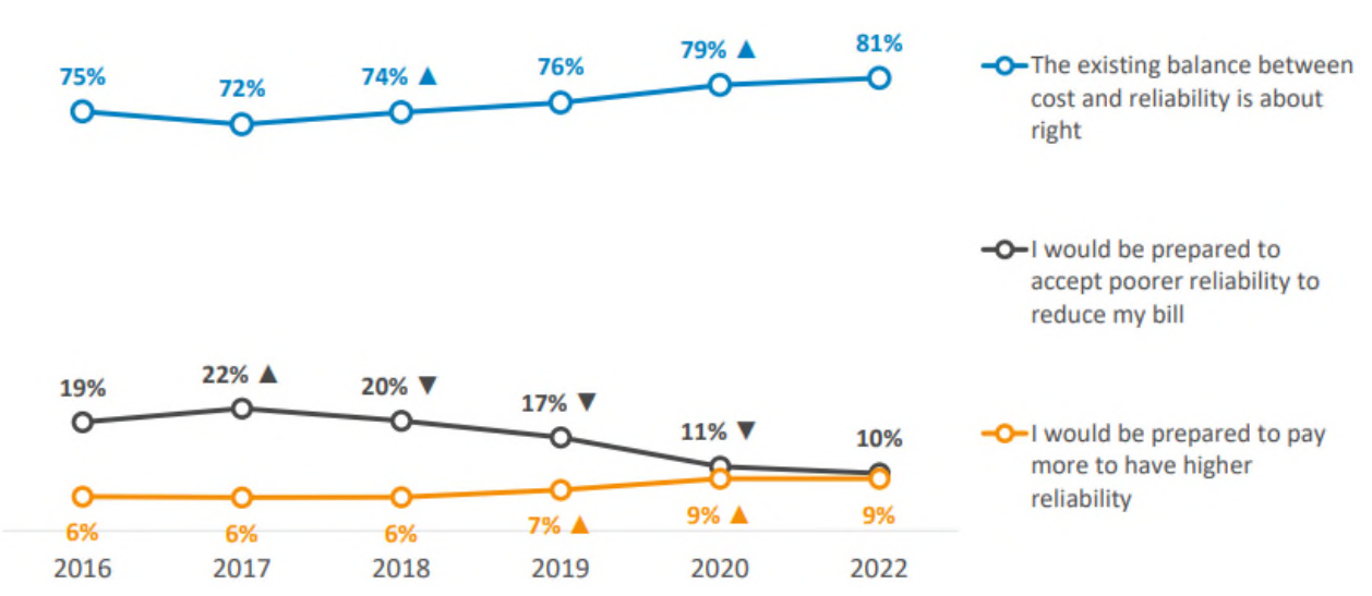
Figure 1: QHES Balance between Cost and Reliability

In regard to the question around the existing balance between cost of electricity and the reliability of the electricity supply the survey respondent's sentiment is shown in the figure below: