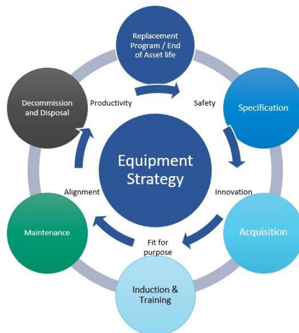
Figure 1: Tools and Equipment Strategy

Replacement cycles for the various types of equipment operated are determined by: